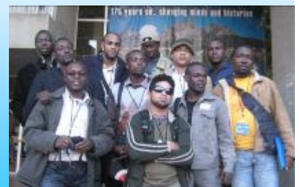
The ILM students at Spring School 2008

“I would just like to say thank you very much because I have learnt a lot during these few days.”