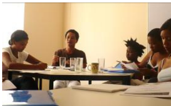
Students at work at the Slave Lodge.